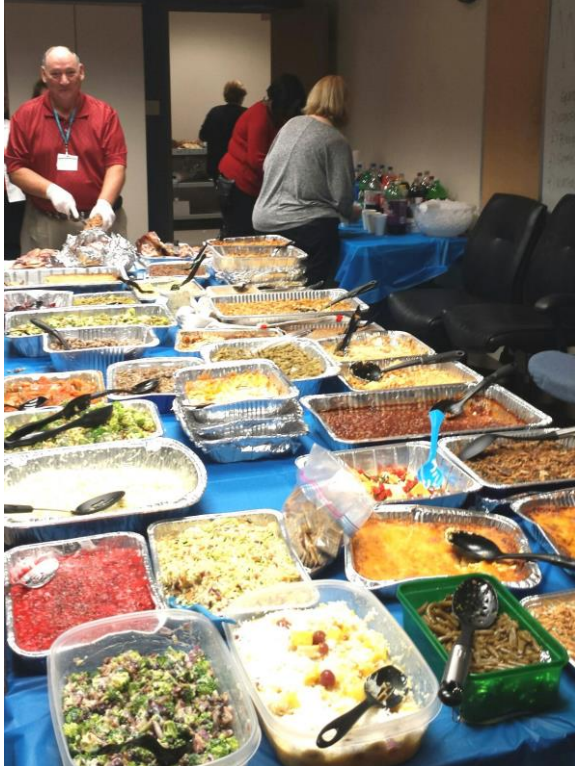
Here are a few of the helpers

This photo shows some of the food. There was another table to the left of the picture, and the desert table in the hallway.