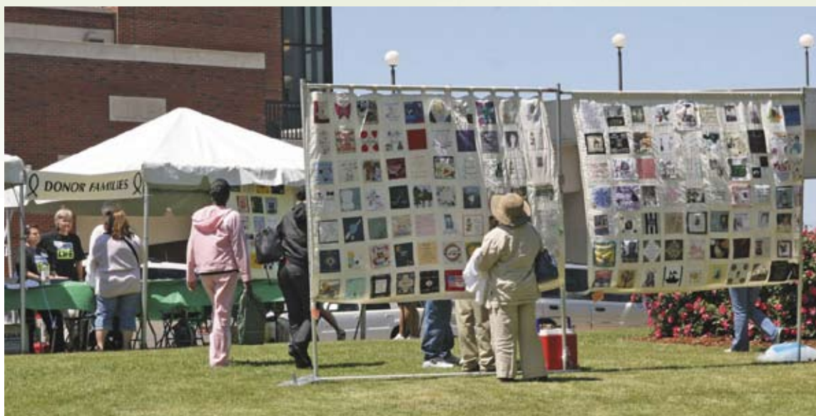
Donor family quilts were on display.

← Butterflies, a universal symbol of recovery, were released to honor donor families and those who received their gift of life.