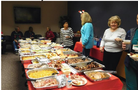
Here are a some of the helpers

If you have never helped with Christmas Day lunch, here are several pictures from 2016 to give you an idea of the amount of food that appears! This photo shows some of the food. There was another table to the left of the picture, and the desert table in the hallway.